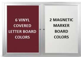
YOU CAN CHOOSE EXACTLY HOW YOU WANT YOUR COMBO BOARD TO LOOK!