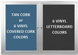
YOU CAN CHOOSE EXACTLY HOW YOU WANT YOUR COMBO BOARD TO LOOK!