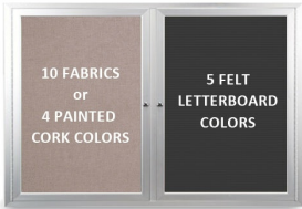
YOU CAN CHOOSE EXACTLY HOW YOU WANT YOUR COMBO BOARD TO LOOK!