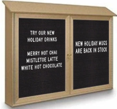
PROTECTIVE ROOF SHELTER TO PROTECT YOUR MESSAGES