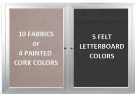
YOU CAN CHOOSE EXACTLY HOW YOU WANT YOUR COMBO BOARD TO LOOK!