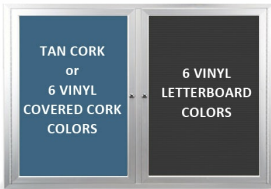
YOU CAN CHOOSE EXACTLY HOW YOU WANT YOUR COMBO BOARD TO LOOK!