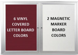
YOU CAN CHOOSE EXACTLY HOW YOU WANT YOUR COMBO BOARD TO LOOK!