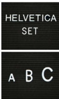
Additional Letter Sets Available