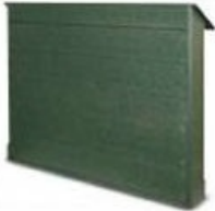
2" Letter Set Included