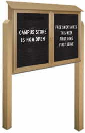
PROTECTIVE ROOF SHELTER TO PROTECT YOUR MESSAGES