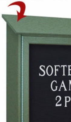
2" Letter Set Included