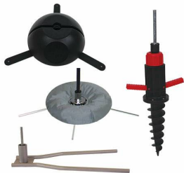
Variety of Optional Bases & Stakes