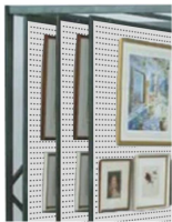
14 Aluminum Finishes