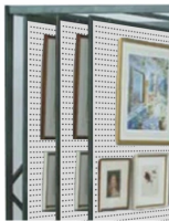
14 Aluminum Finishes