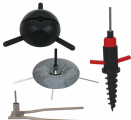
Variety of Optional Bases & Stakes