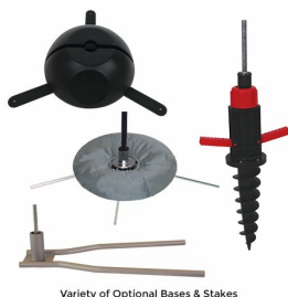
Variety of Optional Bases & Stakes