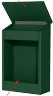
Viewing Area: 78.38 sq. in.