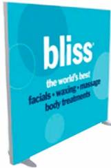
SEG Free Standing Fabric Frames 96" x 120" (IMAGE SHOWN, NOT TO SCALE)

WHEN ORDERING BELOW, SELECT THE DROP DOWN MENU LABELED FABRIC SIZE TO PRINT TO CHOOSE OUR PRINTING SERVICES