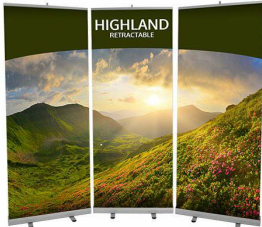
Set of Three (3) 31 1/2" W x 78 1/2" H Banner Stands Total Graphic Area of Approx. 97 1/2" W x 78 1/2" H