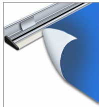
SNAP FRAMES HOLD BANNER DISPLAYS SECURELY IN PLACE

CUSTOM BANNER SIZES AVAILABLE (CALL or EMAIL for QUOTE)