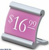
MOUNTED BASES COME IN SILVER & BLACK FINISHES