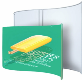
INTERLOCKING TUBES WITH SPRING BUTTON RELEASE, QUICK AND EASY ASSEMBLY

WHEN ORDERING BELOW, SELECT THE DROP DOWN MENU NAMED BANNER PRINTING TO CHOOSE IF YOU WANT A BANNER PRINTED.