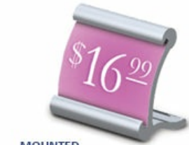
MOUNTED BASES COME IN SILVER & BLACK FINISHES