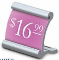
MOUNTED BASES COME IN SILVER & BLACK FINISHES