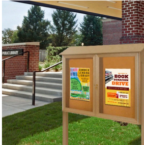
PROTECTIVE ROOF SHELTER TO PROTECT YOUR MESSAGES

FOR CURRENT PRICING, VISIT THE ID # LISTED ABOVE