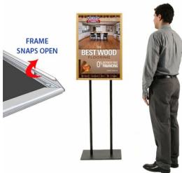
FRAME SNAPS OPEN