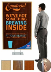
BASE & POLE AVAILABLE IN BLACK OR SILVER