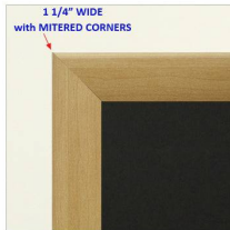
3 WOOD FAUX FRAME FINISHES AVAILABLE