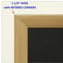
3 WOOD FAUX FRAME FINISHES AVAILABLE