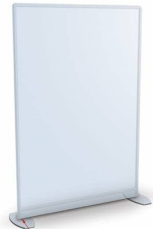
Double bolted bases are 18" long and 8 3/4" wide