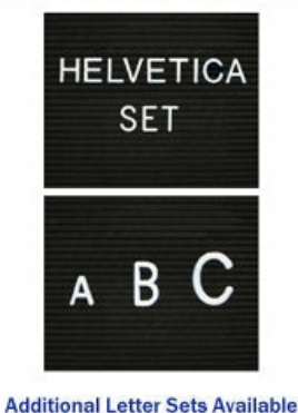
1/2", 3/4", 1", 2" & 3"