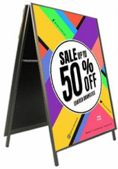
Security Screws Included