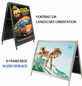
PORTRAIT OR LANDSCAPE ORIENTATION

*PLEASE NOTE: the poster frame and stand are weather resistant, not waterproof or windproof.