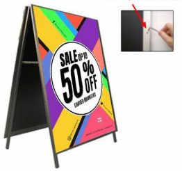
Security Screws Included