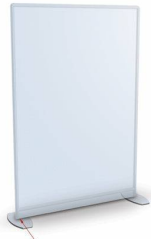
Double bolted bases are 18" long and 8 3/4" wide

WHEN ORDERING BELOW, SELECT THE DROP DOWN MENU NAMED BANNER PRINTING TO CHOOSE IF YOU WANT A BANNER PRINTED.