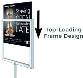
Top-Loading Frame Design