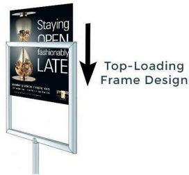
Top-Loading Frame Design