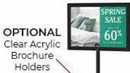
OPTIONAL Clear Acrylic Brochure Holders