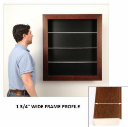
1 3/4" WIDE FRAME PROFILE