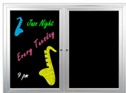
SWINGCASE INDOOR DRY ERASE BOARD