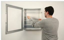
ADJUST YOUR SHELVES AS NEEDED