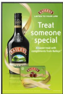
3/8" WIDE METAL FRAME