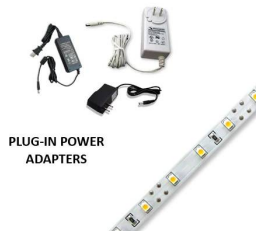
PLUG-IN POWER ADAPTERS

LONG LASTING, GREEN, ENERGY EFFICIENT LED COMPONENTS