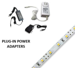
PLUG-IN POWER ADAPTERS

LONG LASTING, GREEN, ENERGY EFFICIENT LED COMPONENTS