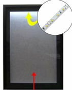
(6) Optional FABRIC COLORS over Natural Tan Cork Board