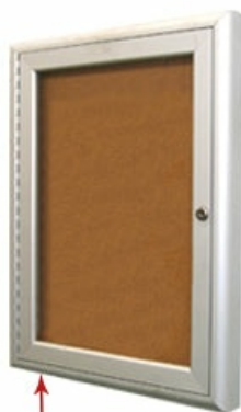
Radius Edge Frame Profile Makes For Sleek Design