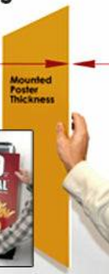
SECURITY TOOL PROVIDED