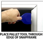
PLACE PALLET TOOL THROUGH EDGE OF SNAPFRAME