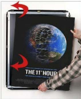
FRONT LOADING - FAST CHANGE OF POSTERS AND SIGNAGE

**Poster Snap Frames are weather resistant...not water-proof