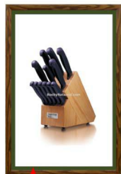
1" VIEWABLE MATBOARD