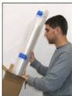
ALL FRAMES SHIPPED UNASSEMBLED SIMPLE & EASY ASSEMBLY