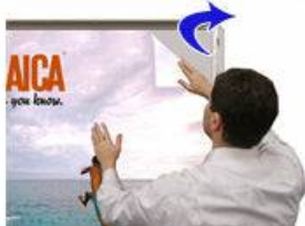
THIN POSTER INSERTS