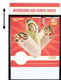
5/8" SLIM DESIGN

FOR CURRENT PRICING, VISIT THE ID # LISTED ABOVE FREE SHIPPING