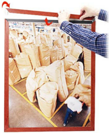
TOP or SIDE LOADING REMOVABLE CAP

FOR CURRENT PRICING, VISIT THE ID # LISTED ABOVE FREE SHIPPING