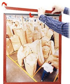
TOP or SIDE LOADING REMOVABLE CAP

FOR CURRENT PRICING, VISIT THE ID # LISTED ABOVE FREE SHIPPING