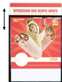
5/8" SLIM DESIGN

FOR CURRENT PRICING, VISIT THE ID # LISTED ABOVE FREE SHIPPING