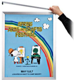
3/4" SLIM DESIGN

FOR CURRENT PRICING, VISIT THE ID # LISTED ABOVE FREE SHIPPING